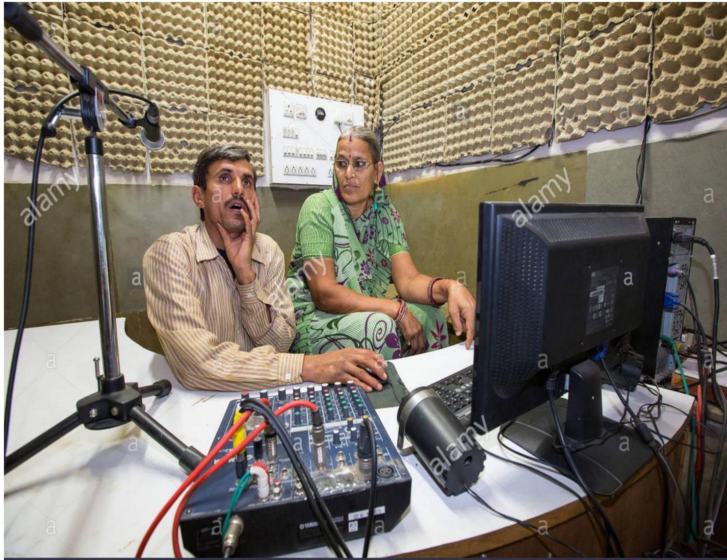
Community radio is a good means for ICH documentation and dissemination