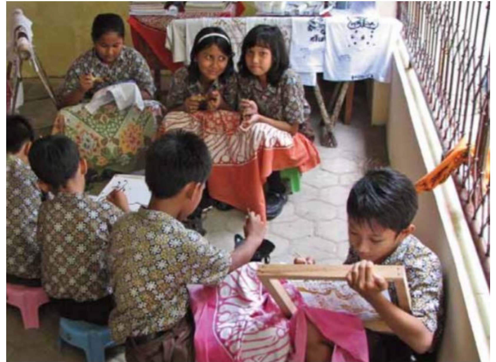
Learning batik in schools in cooperation with the museum, Pekalongan, Indonesia